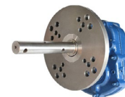
SMR Accessories Screw Conveyor Adapter Flange