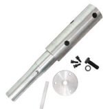
SMR Accessories Drive Shafts