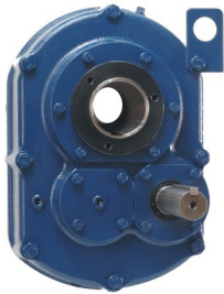
Shaft Mount Reducer

NAE's shaft mount gear reducers offer dependability and performance you can trust. They come in box sizes from 2 - 10 and are in-stock every day. They are designed with quality bearings that provide you with a high-performance product to get the job done. Our Shaft Mount Gear Reducers are a Direct "Drop In" for TXT style gearboxes and we have a complete line of accessories and repair kits to go with them.