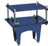
SMR Accessories Motor Mount