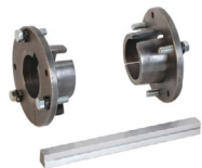
SMR Accessories Bushing Kit

Stay ahead of downtime with NAE's readily available shaft mount gear reducer accessories and repair kits. Our product selection ensures you have everything you need to stay operational and efficient. Don't let anything slow you down -stay up and running with NAE.