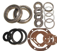
SMR Accessories Repair Kits